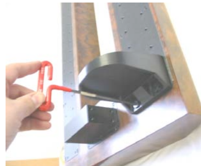
Photo 26 Top Bracket Orientation