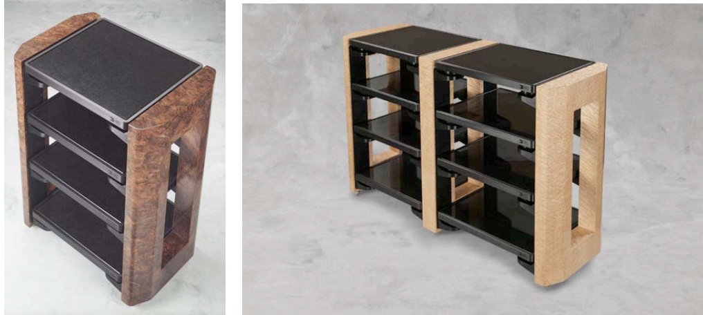
Photo 28 Completed MXR Audio Stands. Singlewide shown on left, and double wide shown on the right.

Loading Components into MXR Frame - Carefully load each component into the MXR Audio Stand. Be careful not to hit the front edge of the isolation base because you will scratch the aluminum frame. Once all the components are loaded, you should check to see that none of the isolation bases are overloaded. By placing one or two fingers on the bottom of the bracket and your thumb on the top of the isolation base, you should be able to move the top of the isolation base slightly (at all four corners) when you squeeze your finger(s) together. If there is no compliance, remove the isolation base and component to verify the load range of the isolation base is correctly matched with the component. The load range of the isolation base is identified as part of the part number on the tag attached to the bottom (see the isolation base manual for instructions). Please consult with your authorized Harmonic Resolution Systems dealer or contact Harmonic Resolution Systems if you need assistance. The isolation base load range can be easily modified at any time by sending it to Harmonic Resolution Systems or an authorized dealer to have the primary isolation stage rebuilt.